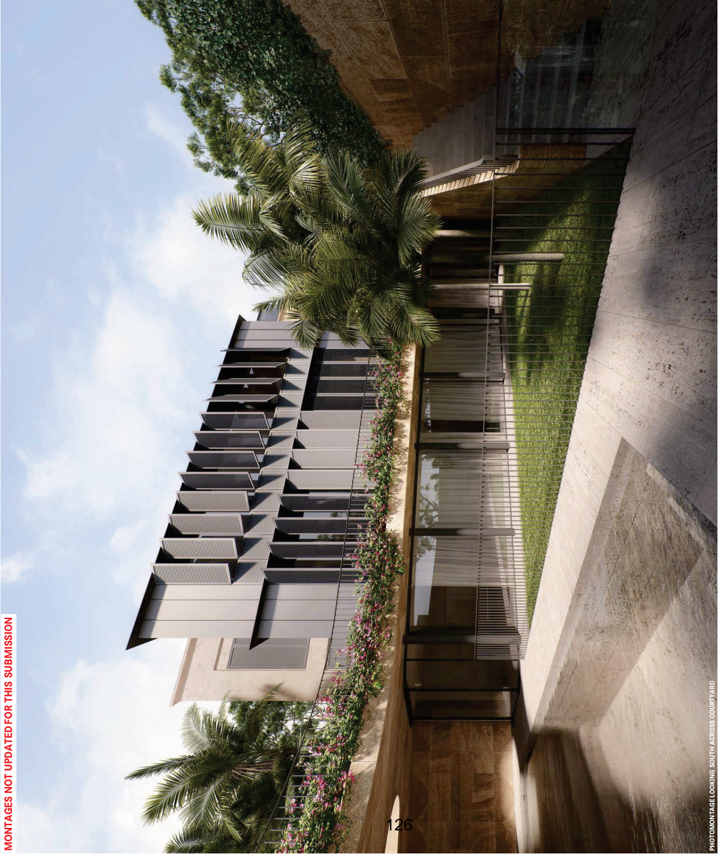
PHOTOMONTAGE LOOKING SOUTH ACROSS COURTYARD

MONTAGES NOT UPDATED FOR THIS SUBMISSION